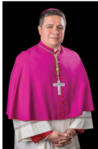
Bishop Evelio Menjivar

Biographies of Bishop Campbell and Bishop Menjivar are available here .