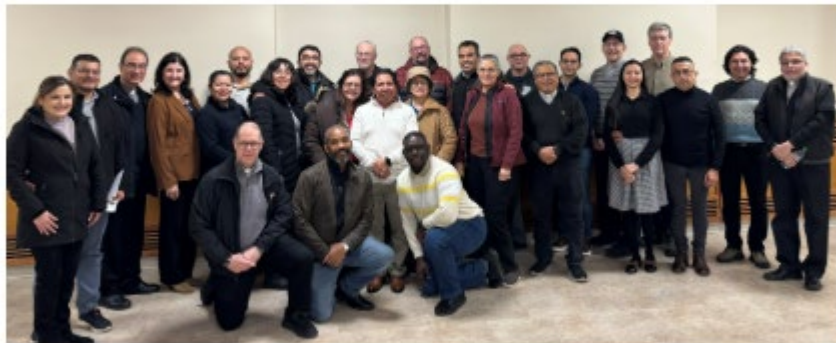
(Pictured above, inquirers, deacons, and wives at the Come and See meeting held at Saint Martin of Tours Parish in Gaithersburg, Maryland on February 23).