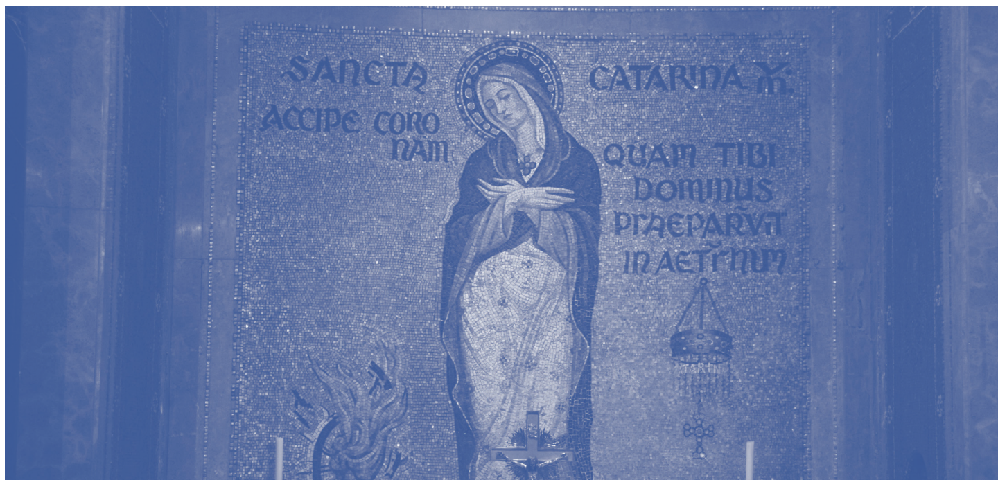
The mosaic of St. Catherine in the east hemicycle of the rounded chapel, designed by John Louis Bancel LaFarge reflects the theme of her martyrdom.

The Basilica of the National Shrine of the Immaculate Conception is renowned as the largest Catholic Church in the United States and one of the ten largest churches in the world. It is also celebrated for the diversity on display in the numerous chapels, altarpieces, windows, murals and freestanding works of art that converge within it.