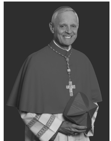
Donald Cardinal Wuerl 2006-2019