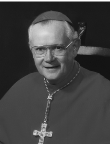
James Cardinal Hickey 1980-2000