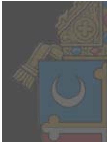
Theodore E. McCarrick 2001-2006