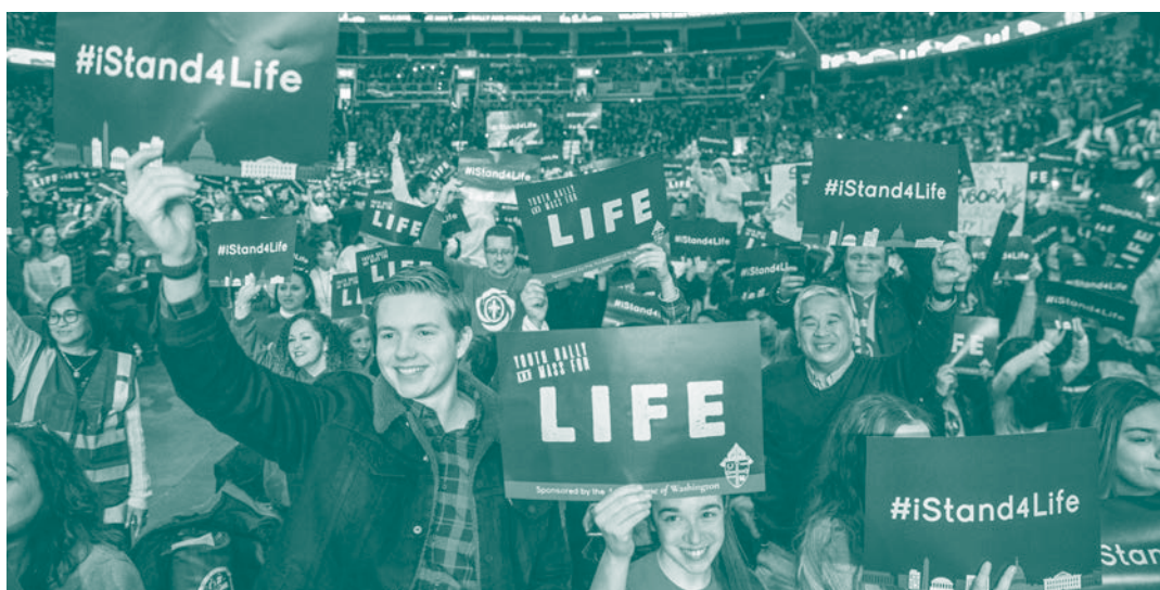
Throng of young people gathered to rally and pray for an end to abortion during the Rally and Mass for Life on January 24 in Washington.

Nearly 18,000 young adults attended this year's Youth Rally and Mass for Life on January 24, the annual event hosted by the Archdiocese of Washington. The rally generates energy and zeal from Catholic youth traveling to Washington, D.C., for the national March for Life.