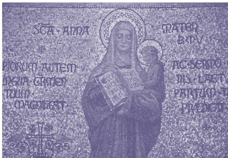
The mosaic of St. Anne in the Crypt Church.

St. Anne is the patron saint of mothers, housewives, and women in labor, and she is often depicted with Mary and