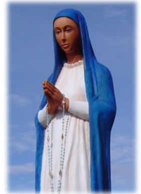
Our Lady of Kibeho Pray for us

In 1981 in Rwanda, Mary appeared to eight young people, in the small village of Kibeho. Through these young people, Mary warned them of a great number of people would die if the Rwandans didn't open their hearts to God's love. In 1994, the prophecies tragically came true during 100 days of savage bloodletting and mass murder. After the genocide, and two decades of rigorous investigation, Our Lady of Kibeho became the first and only Vatican-approved Marian site in all of Africa. But the story still remains largely unknown.