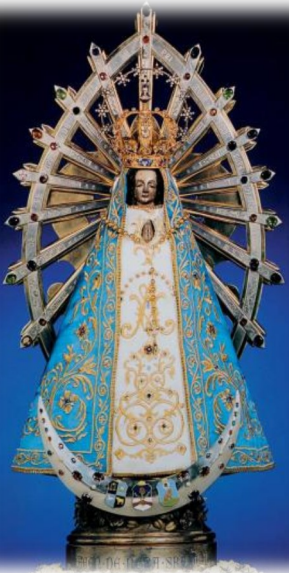
Our Lady of Lujan Pray for Us

When the caravan wanted to resume the journey, the oxen refused to move. Once the crate containing the image of the immaculate conception was removed, the animals started to move again. Given the evidence of a miracle, people believed the Virgin wished to remain there. The image was venerated in a primitive chapel for 40 years. Then the image was later carried to Luján, where it currently resides.