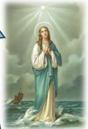
Our Lady Star of the Sea

The idea of Mary as a guiding star for seafarers has led to devotion to Our Lady, Star of the Sea in many Catholic coastal and fishing communities .