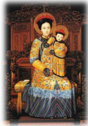
Our Lady of China