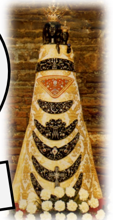
Our Lady of Loreta Pray for us

The tradition of the shrine at Loreto goes back to the year 1291. As the last of the crusaders returned to Western Europe they brought with them a number of relics, objects of devotion and remembrances of holy shrines. It happened that the dwelling of the Blessed Virgin Mary, the house which both tradition and Christian devotion had maintained as the site of the appearance of the archangel Gabriel and therefore the Incarnation of our Savior, was moved from Nazareth to Christian Europe. The house arrived at Loreto on December 10, 1294.