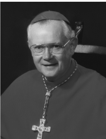
James Cardinal Hickey 1980-2000