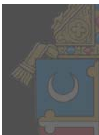
Theodore E. McCarrick 2001-2006