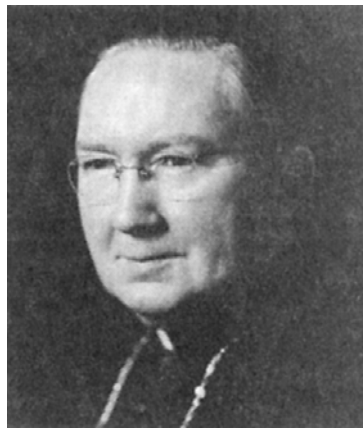
Patrick Cardinal O'Boyle 1948 -1973