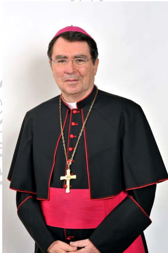
His Excellency Archbishop Christophe Pierre Titular Archbishop of Gunela Apostolic Nuncio to the United States

Mailing Address: 3339 Massachusetts Avenue, NW, Washington, DC